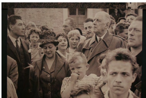
De Gaulle Was Tall