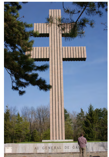
Memorial to De Gaulle