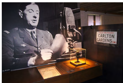
Broadcasting to The Free French